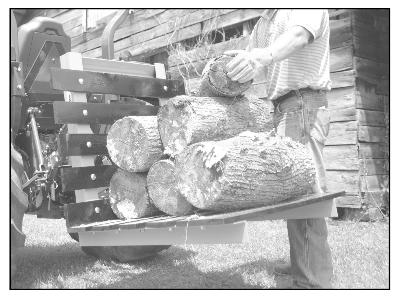
FRAME HAS PRE-PUNCHED HOLES BUT BOARDS ARE NOT INCLUDED