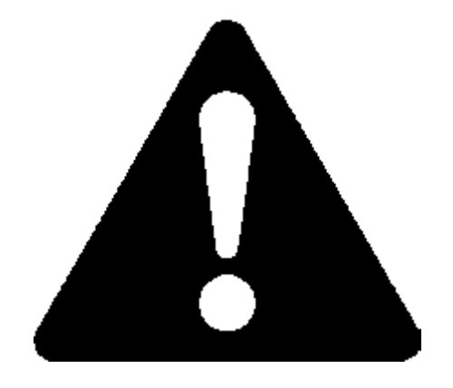
THIS SYMBOL MEANS ATTENTION! BECOME ALERT! YOUR SAFTEY IS INVOLVED

TAKE NOTE! THIS SAFETY ALERT SYMBOL FOUND THROUGHOUT THIS MANUAL IS USED TO CALL YOUR ATTENTION TO INSTRUCTIONS INVOLVING YOUR PERSONAL SAFETY AND THE SAFETY OF OTHERS.